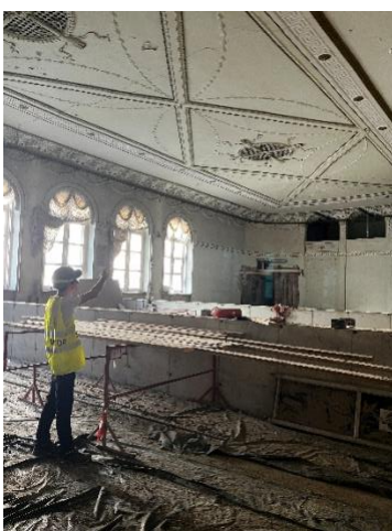
Dance salon above the main hall