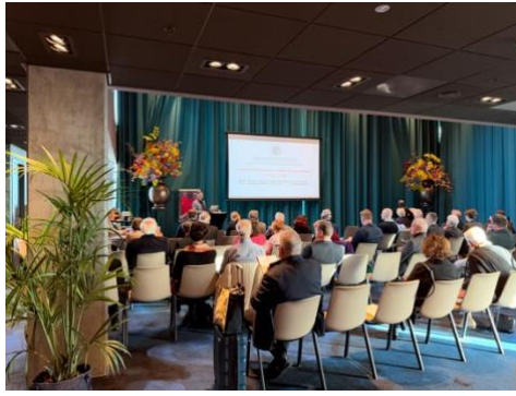
RWVI delegates gather for the AGM