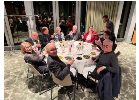
RWVI Gala Dinner

Clockwise from right 1-4: Dutch National Opera & Ballet production of Tristan und Isolde 5. Symposium