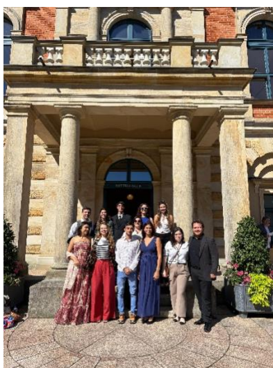
Before Rheingold at Festspielhaus Stipendianten from Italy, Spain, Argentina, Brazil, Chile, Armenia and Mexico