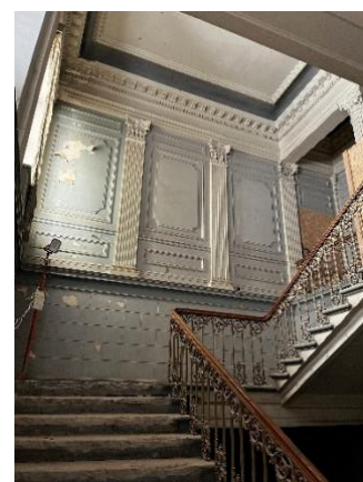
Original facade: stairs leading to the second gallery