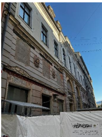
Front of the Wagner Theatre in Riga, Latvia

In September 2025, I had the wonderful opportunity to visit the city of Riga and witness the restoration of the Wagner Theatre. This is currently possibly the most ambitious project ever undertaken by a Wagner society.