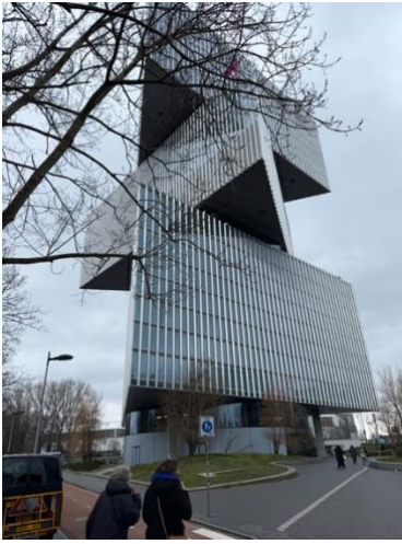
The nhow Amsterdam RAI hotel